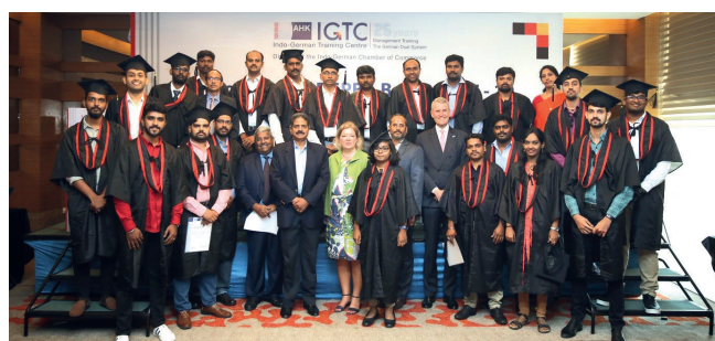
Graduating students along with the dignitaries

As the graduates were eagerly waiting to get their certificates, the program continued with the awarding ceremony. The dignitaries proceeded to award the Certificates to the PGPBA students followed by the Executives of the EBMP batch.