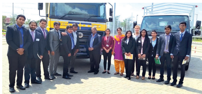
Students along with IGTC Staff and Daimler Staff

IGTC Chennai Students were presented with an opportunity to get first-hand exposure to the best manufacturing practices of worldwide innovation leader in trucks and buses "Daimler India Commercial Vehicles Pvt. Ltd", located in Oragadam, near Chennai.