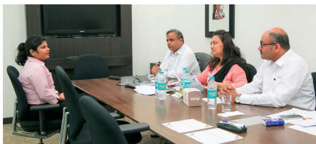
Selection process for the Batch 2019 – 2021

The IGTC family has added another 104 young members, which will be inducted into the course by end of July with a formal inauguration and induction ceremony. IGTC Team welcomes the new PGPBA Batch 2019 – 2021.