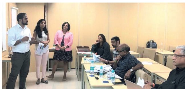
Final Capstone presentation for the EBMP Mumbai Batch 2018 – 2019

On 15 th and 16 th , December 2018, the 5 th EBMP Pune Batch 2018 as well as the 9 th EBMP Mumbai Batch 2018 – 2019 on 3 rd August 2019 presented several interesting topics.