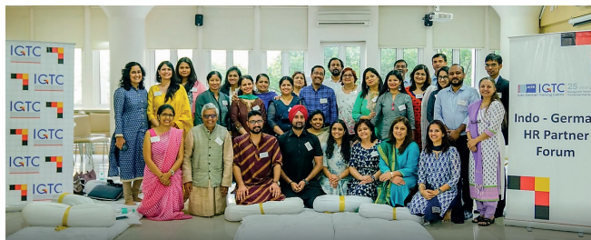
The Indo-German HR Partner Forum at the Indo-German Training Centre

and acquisitions, cultural assimilation, how do leaders address doubts of employees during mergers and also how do companies maintain gender diversity. The topic of Performance Management will be covered in the next meeting in 2019.