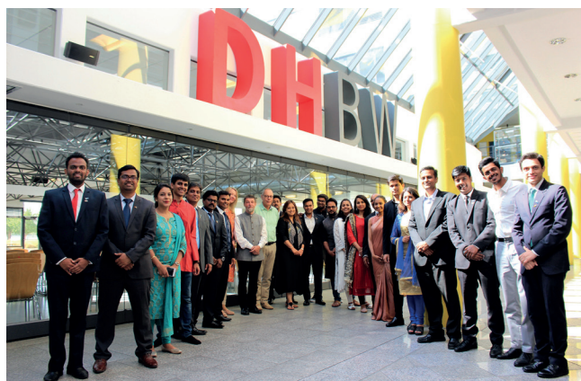
Participants at the Duale Hochschule Baden-Württemberg (DHBW)

The purpose of the visit was to share and experience the unity in its diverse system of Education and Training between DHBW and IGTC. The most interesting parts of the exchange programme were the various Guest Lectures arranged by the DHBW faculty, visits to