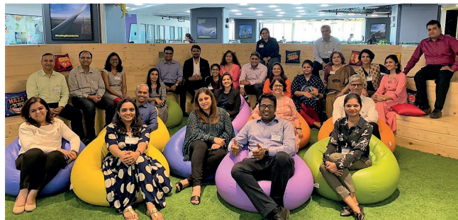
Explore the agile work spaces – Covestro office Tour