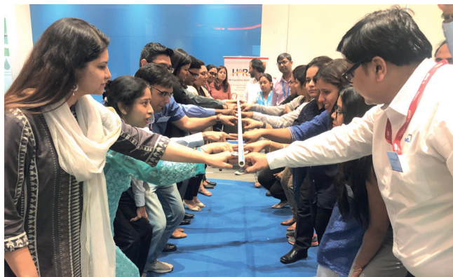
The Consultative Mindset programme made use of experiential games and role-plays to create an impact

"Horizon Redefined", the HR Capability Building Initiative designed by the Indo-German HR Partner Forum for the HR community was delivered with a high level of engagement and importance by the Indo-German Training Centre from June 2018 to February 2019. Approximately 125 employees from the HR teams of 23 German organisations built their competencies by undergoing training on various topics, which the Indo-German HR partners fondly named as the ABCDE modules of HR, namely Analytical Mindset, Business Acumen, Consultative Mindset, Digitalization and Employee Relations.