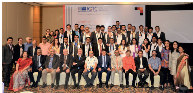
EBMP 8 th Mumbai Batch 2017 - 2018

On September 9 th 2018, managers of the 8 th Executive Business Management Programme (EBMP) batch moved a step closer to becoming future CEO's in their respective fields. Although eagerly awaited by all, this day was filled with bitter-sweet moments. Sweet because it was an accomplishment and a milestone in their professional careers; bitter because it was an end to the beautiful, one-year journey of learning and friendships at IGTC. The atmosphere was brimming with excitement and positive energy as the managers arrived with their families. Children walked in with a cheeky sense of pride into their parent's graduation ceremony.