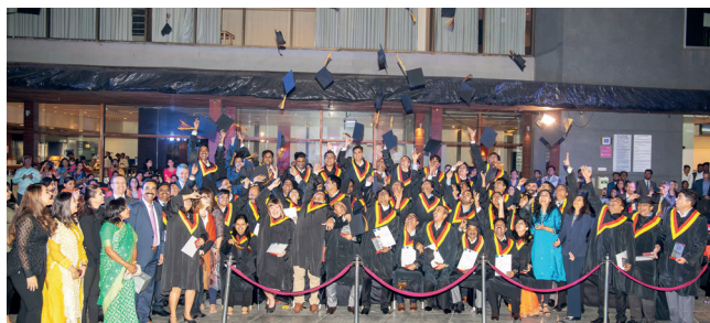
The 5 th batch tossing their hats after the ceremony

12 th of January 2019 was an exceptional day for Indo-German Training Centre (IGTC) Team as we felicitated the 52 experienced managers who put in a lot of dedication and devotion all through the last year. The New Year, 2019 began on a happy high note for these 52 participants of 5 th Batch of Pune Executive Business Management Programme as they all gathered together, along with their Families, Dignitaries, Corporate Partners, Mentors, Faculty and Alumni at the venue Crown Plaza Pune for their Graduation Ceremony.