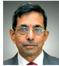
K. Parameswaran International Finance