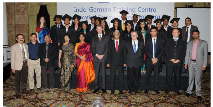
Graduating students with dignitaries and IGTC faculty at Bangalore