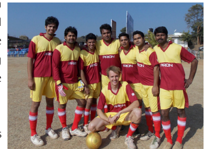
IGTC football team

The 6 th IGCC Football Tournament 2013 took place on Sunday, 20 th January 2013 at the SPT Sports Academy on Sarjapur Road. Around 350 spectators cheered on the 200 football players. All the 17 teams were ready to win the desirable trophy. Like every year, the students from the Indo-German Training Centre also formed a team. Students from both batches came and supported their team throughout the whole day. Robert Bosch Engineering emerged as the winner of the tournament.