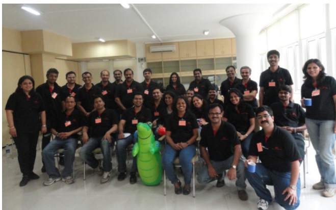
EBMP Batch 2012-2013

The participants of the 3 rd Batch of the Executive Business Management Programme (EBMP) successfully completed their programme at IGTC. The 4 th batch of the EBMP was inaugurated on 27 th July 2013. The batch comprises of participants from Indo-German member companies such as BASF India, Rittal, Siemens, Volkswagen, Wacker Chemie among others.