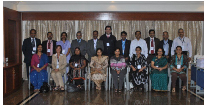
HR Partners Meet at Bharat Forge