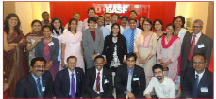
HR Partners Meet at BASF