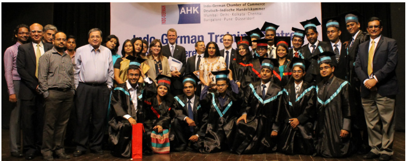
IGTC Kolkata students with guests and faculty members