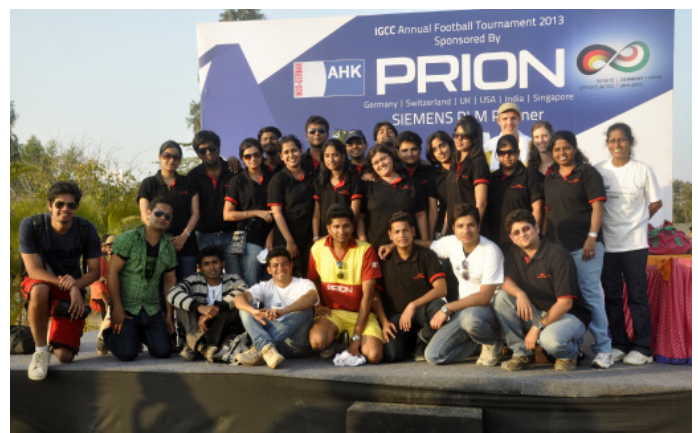
IGTC team with supporting IGTC spectators including the IGTC management

Besides the football matches there were other attractions during the day like the "Goal-Wall Shooting Competition," which was a great success. The IGTC students volunteered energetically during the whole day. They managed both events successfully and they supported the organizers professionally. Furthermore, the students used this great opportunity to network with representatives from the Indo-German business community.