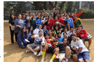
Football Tournament organized by Batch 2012-2014

The enthusiastic 2012-2014 batch organized a Football Tournament on 28 th November 2012 at Sabina Chandrashekhra Maharanganjan Maidan, Colaba. It was a great learning experience as they realized the importance of team work as the ultimate key to success.