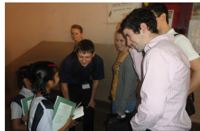
Interacting with students at Akanksha