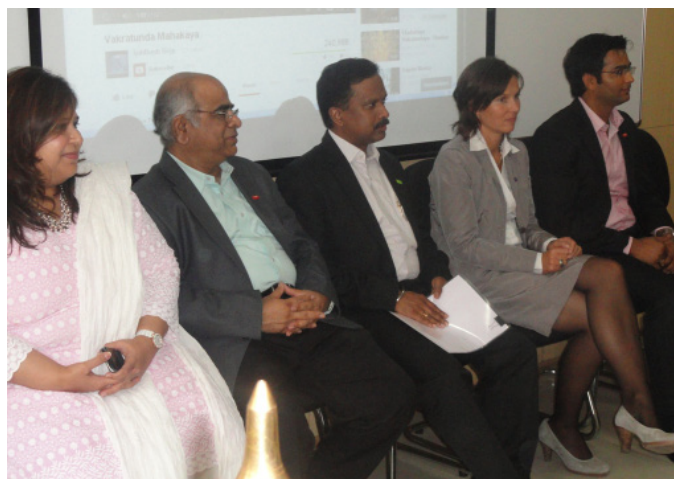
The BASF Team for the inaugural of the Seminar Series on Corporate Governance and Business Ethics