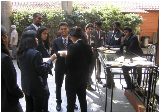
IGTC students during the networking lunch

IGTC Bangalore students attended the conference and supported IGCC with the organization of the event. It was a very good learning experience for IGTC students because the conference topics complemented the IGTC curriculum. The students were able to gain knowledge in an area that is very important for business. During the networking lunch and tea breaks they had an excellent opportunity to talk to representatives from industry and research.