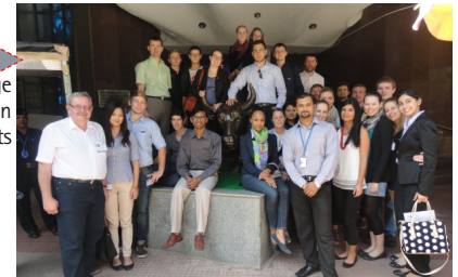
At the Bombay Stock Exchange after their session on Indian Capital Markets