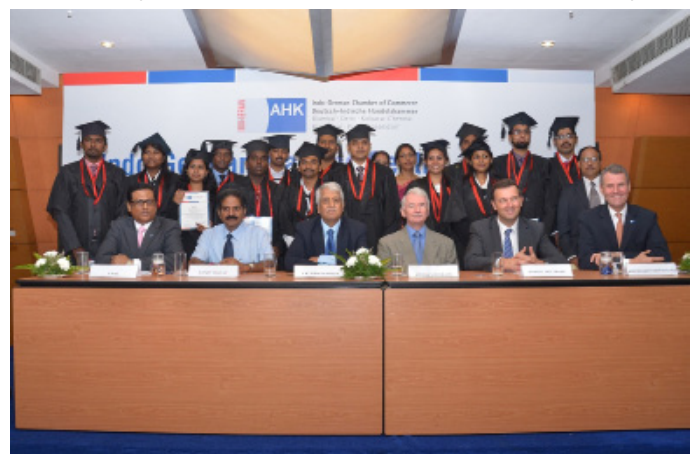
IGTC Chennai graduating batch along with the dignitaries